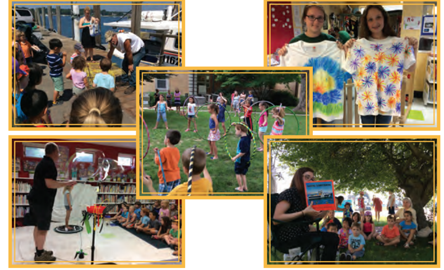
Summer Reading 2015